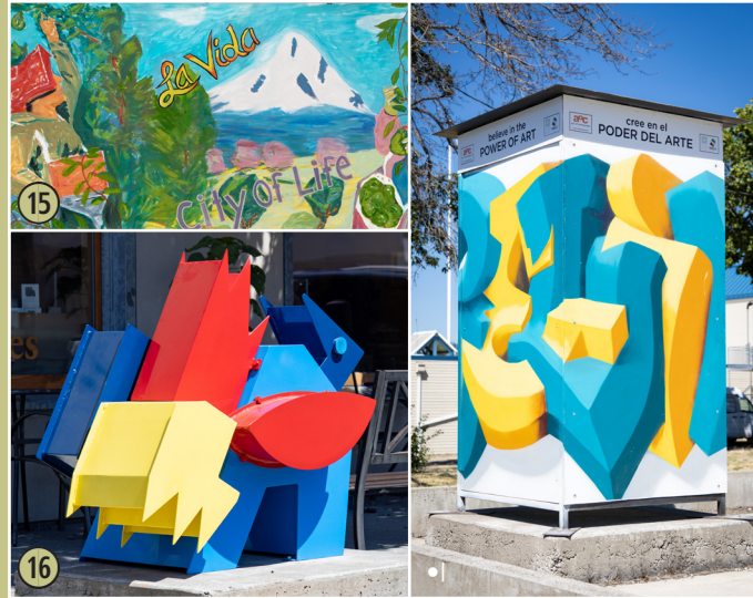
THE HEIGHTS #15-16